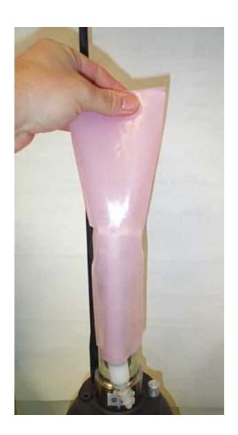
IMPORTANT: Remove plastic bag and three plugs from CTD sensor, if they have not already been removed.

1. Secure float in horizontal position, using foam cradles from crate.